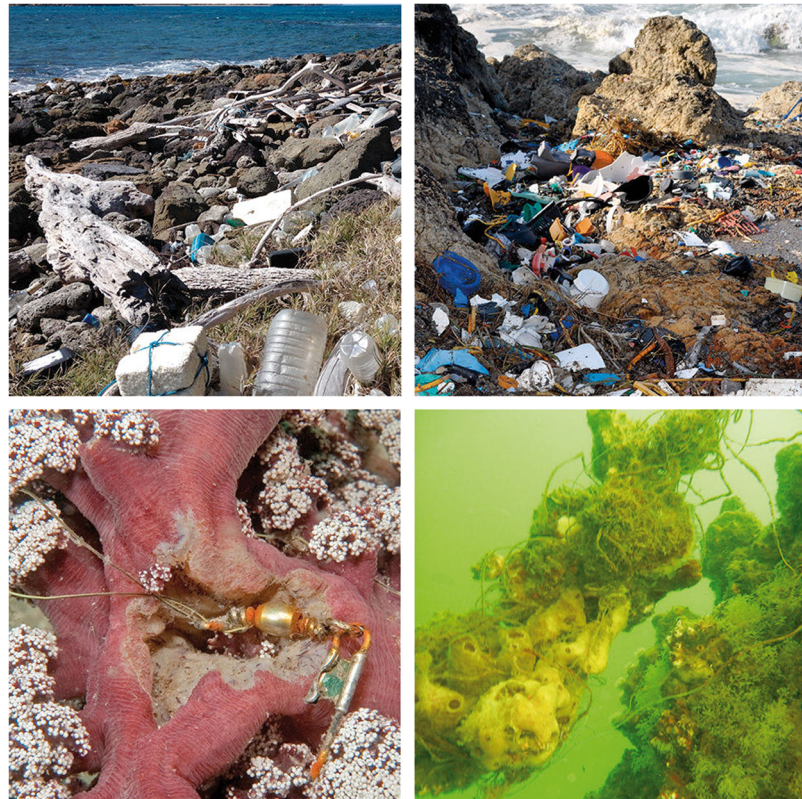
Fig. 2. Clockwise from top left—beach debris from a remote beach on Catholic Island, Grenadines (courtesy Jennifer Lavers); debris accumulation on an urban beach (Stradbroke Island, Australia) (courtesy Kathy Townsend); entanglement and damage to soft coral by fishing line (courtesy Stephen Smith); and fishing line entanglement of a pier with algae and sponges growing on it (courtesy Kathy Townsend)

Quantifying the impact of plastic pollution on the physical condition of habitats has received little attention (but see Votier et al. 2011, Bond & Lavers 2013, Lavers et al. 2013, 2014) relative to the impacts of plastic pollution on organisms (e.g. Derraik 2002, Gregory 2009). However, in intertidal habitats, accumulation of plastic debris has been shown to alter key physico-chemical processes such as light and oxygen availability (Goldberg 1997), as well as temperature and water movement (Carson et al. 2011). This leads to alterations in macro- and meiobenthic communities (Uneputtu & Evans 1997) and the inter-