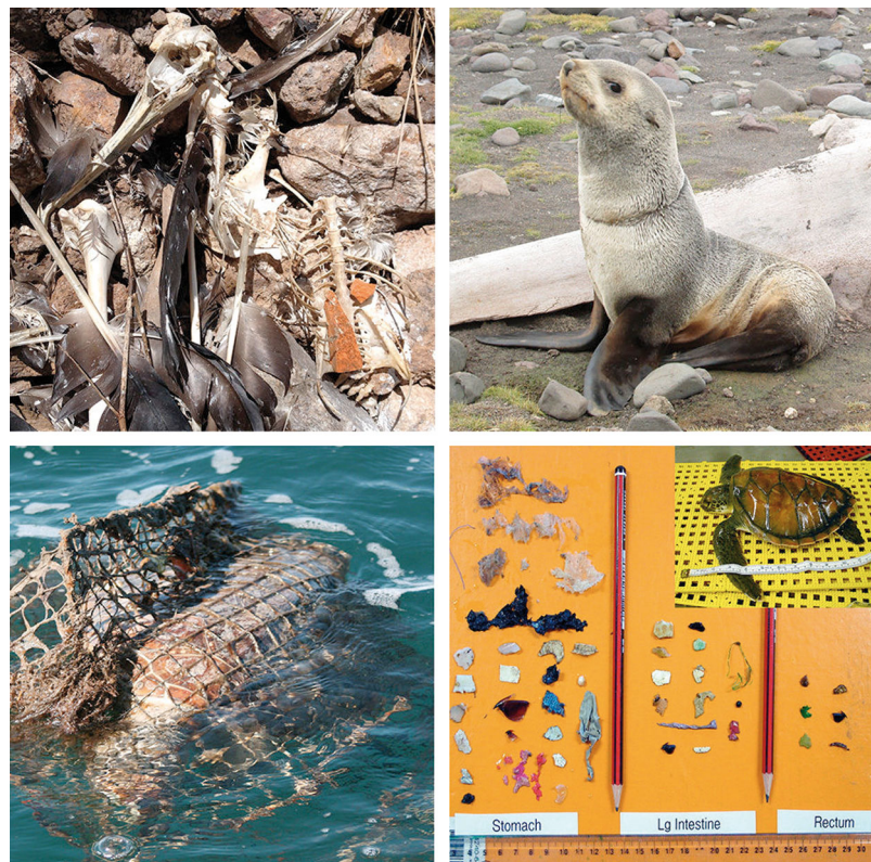
Fig. 3. Top left to bottom right — magnificent frigatebird Fregata magnificens carcass from Battowia Island, Grenadines, with orange foam contained within stomach; Antarctic fur seal Arctocephalus gazella , with plastic ring entanglement at King George Island, Antarctica; juvenile green turtle Chelonia mydas trapped in discarded crab trap and plastic fragments recovered from the gut of a juvenile green turtle

When taken in conjunction, it is clear that plastic pollution is impacting food webs through ingestion